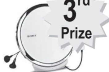
SONY PORTABLE CD PLAYER DEJ885 (worth £79)