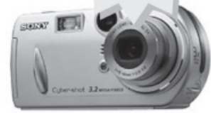
SONY CYBERSHOT DIGITAL CAMERA DSCP72 (worth £279)